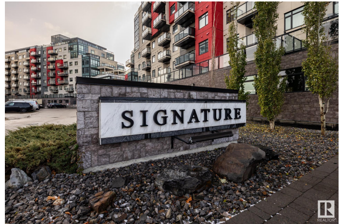
Main Building, Total Interior Area Above Grade 1442.81 sq ft

MLS® # E4421208 Price $409,999 Bedrooms 1